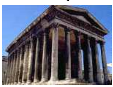
Explore the core beliefs of Roman Religion, beyond the mythology, in our section Roman Religion.